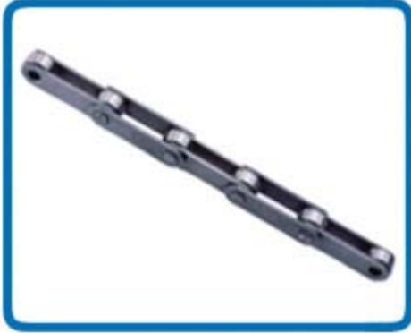
EUROPEAN SERIES (BS) - SOLID PIN CHAINS