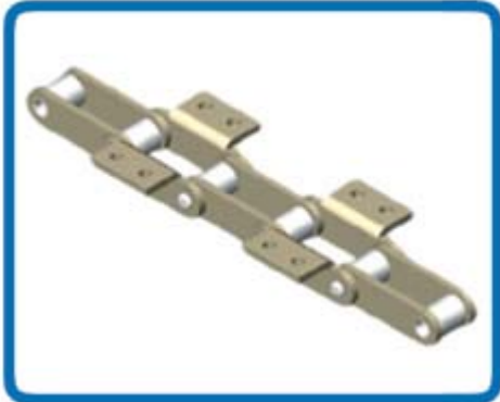
DOUBLE PITCH A2, K2 ATTACHMENTS