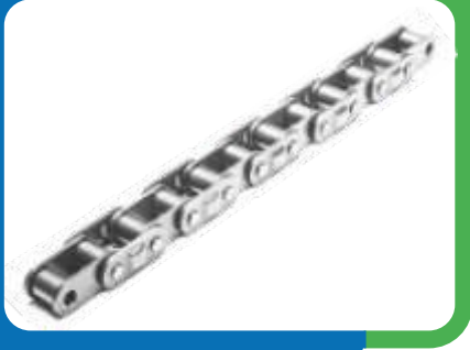
ISO 487/DIN 8189/ASME B29.19M